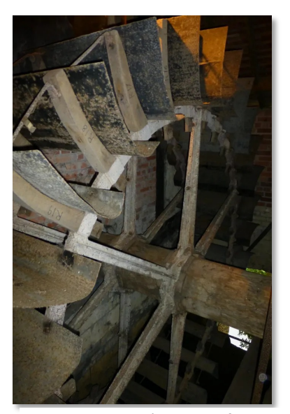
The Waterwheel (obtained from St Helen's – Abingdon)

The wheel is of an undershot design and there were various mill ponds, watercourses and sluice gates above it for controlling the water flow (also fish ponds below used to provide the Abbey). These can be seen on the old maps.