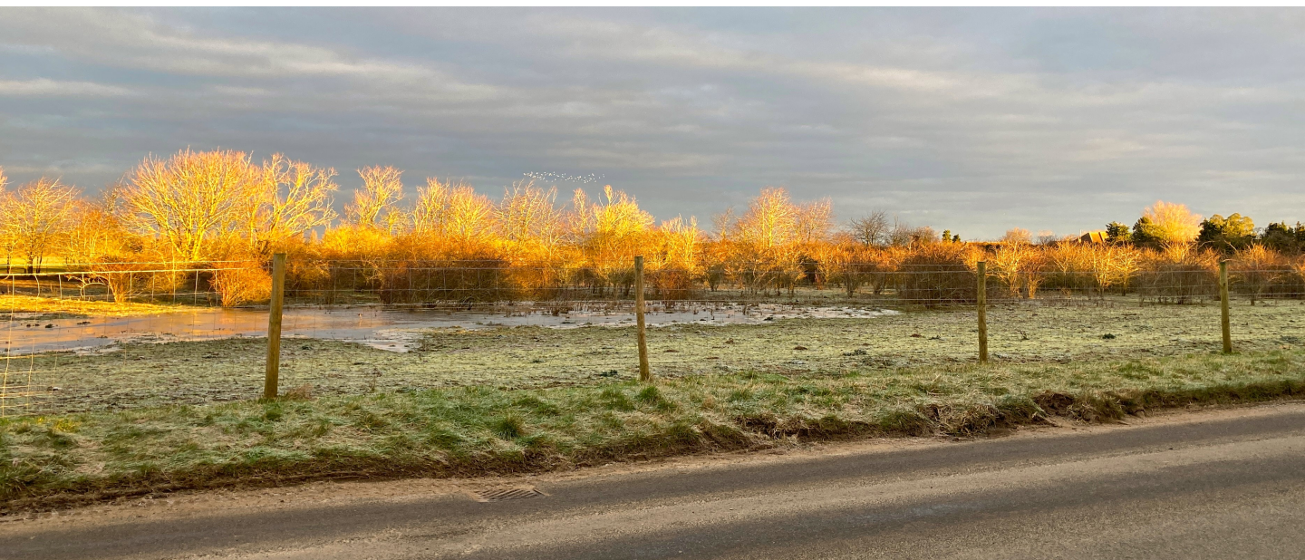
A cold January morning in Charney Bassett View across the fields from Buckland Road by Ken

Again, many thanks to all those who completed the Chatter survey for your input and interest. As mentioned in December, there were a good number of responses (73), plus positive feedback and suggestions for inclusion of additional items.