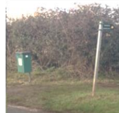
A - At Cherbury Camp footpath entrance on Buckland Road