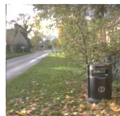
B - Main Street/ Buckland Road Junction