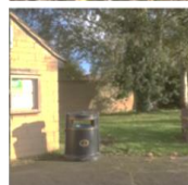
C - Orchard Close

I would encourage anyone in the village who witnesses someone not picking up after their dog to report them to the Vale Council . If you need assistance in doing this, please contact the Parish Council for any help and support. The dog owner is guilty of an offence and if reported can expect to receive a visit from the Vale and a fine £50. If this is what it takes to encourage the practice of dog fouling to stop, then this is what has to be done.