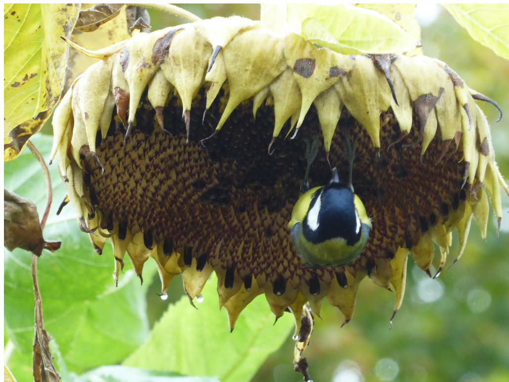
A Great Tit on a sunflower in a Charney garden