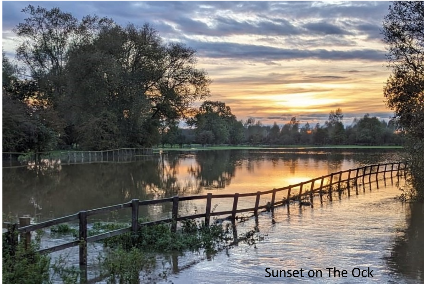
Sunset on The Ock