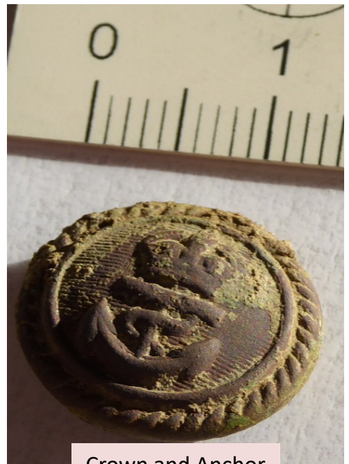
Crown and Anchor Royal Navy Button