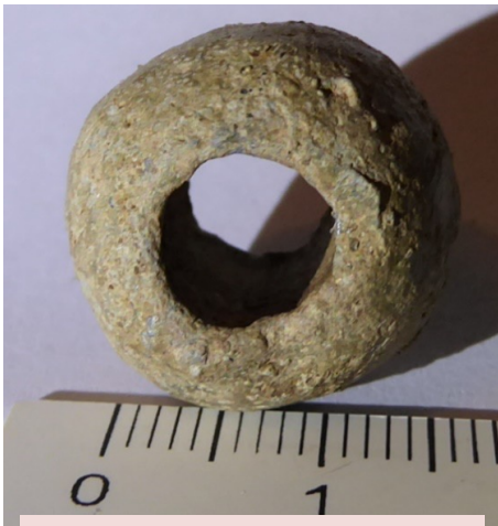
Lead Spindle Whorl Weight