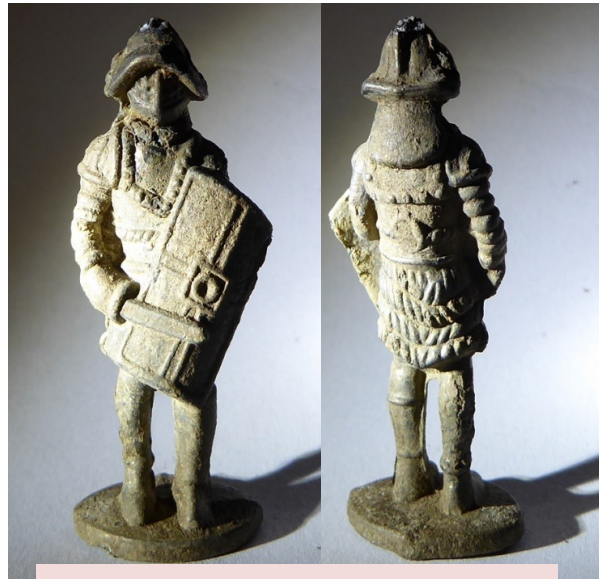
Modern Lead toy Roman gladiator