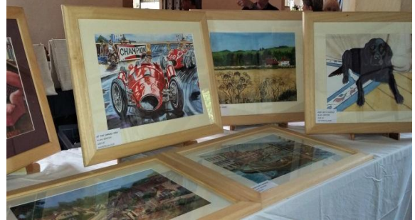
Charney Mill open afternoon