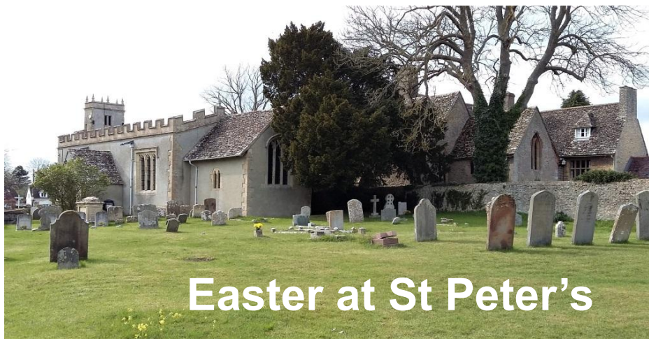
Easter at St Peter's