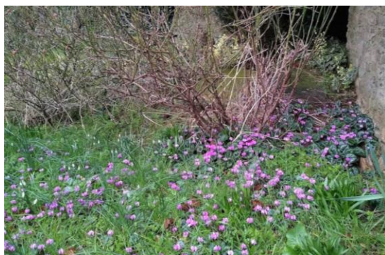
Cyclamen in the Churchyard