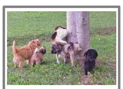
Eagerly awaiting the start in February of the tree planting on the Charney field.