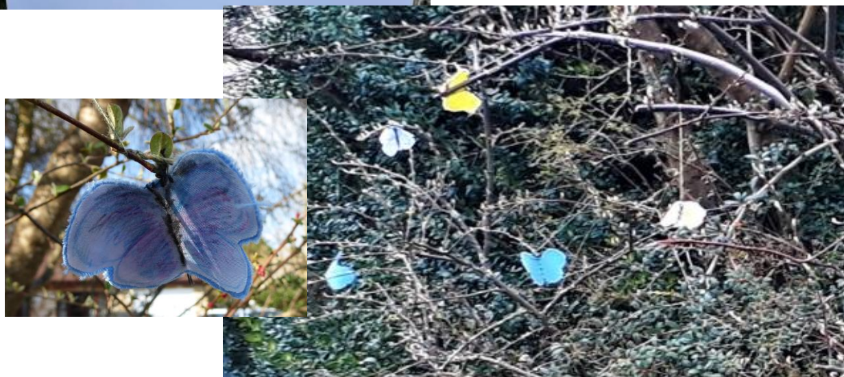
On the Bridlepath, another participant in the The Great Big Art Exhibition Gallery - Firstsite . Open to all ages and abilities.