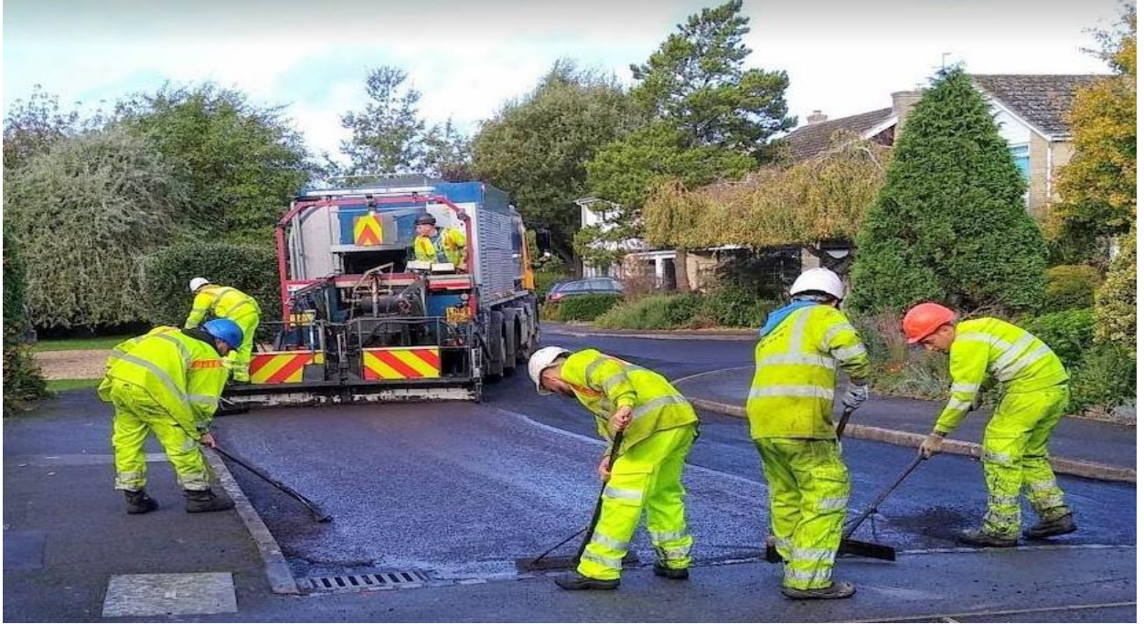
The great Orchard Close makeover