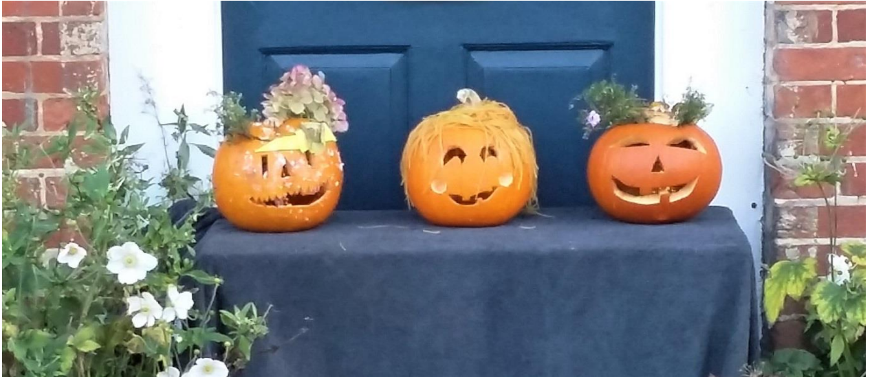
Pumpkins were carved and prizes won