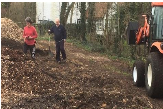
Then on to spreading the chippings.