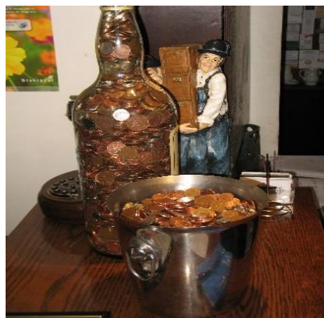
(£293.63 when the counting machine at Sainsbury's packed in)

Cakes were brought and sold, cream teas devoured, raffle tickets snapped up, auction bids made and bags of loose change donated - all in a relaxed community atmosphere.