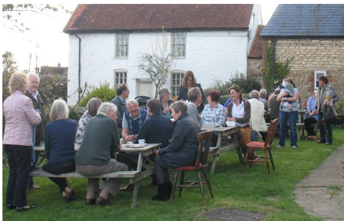
(Villagers enjoying cream teas in the sun)