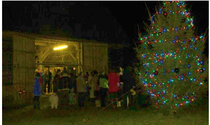
Carols on the Green 17 th December