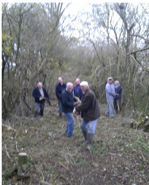
Charney Army at work

The Charney Army with the help of David Godfrey has now completed the first stage of the plan by clearing vegetation along the causeway in four working sessions amounting to some 70-80 hours of work.