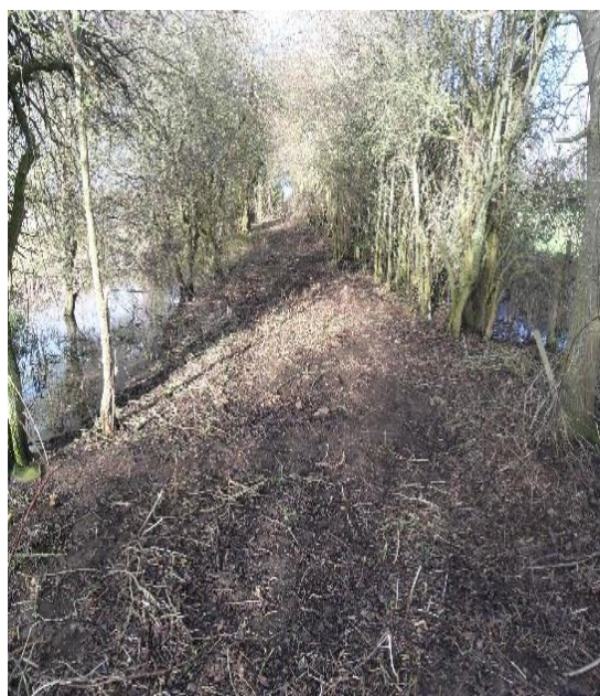
Water on each side of the causeway