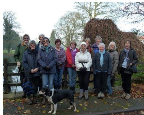
December walk around Lockinge and Ardington