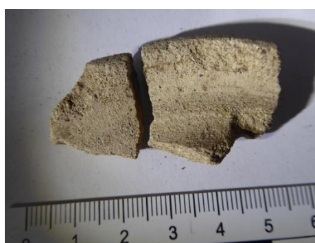
Medieval pot rim