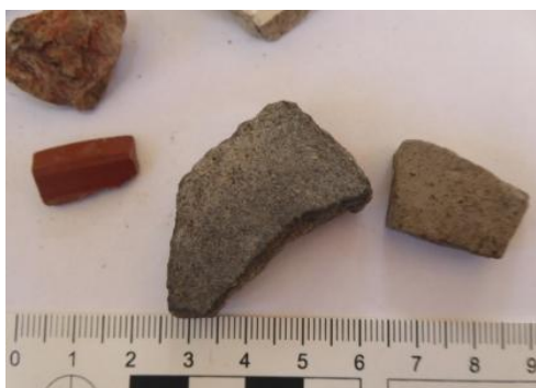
Roman and Medieval potsherds