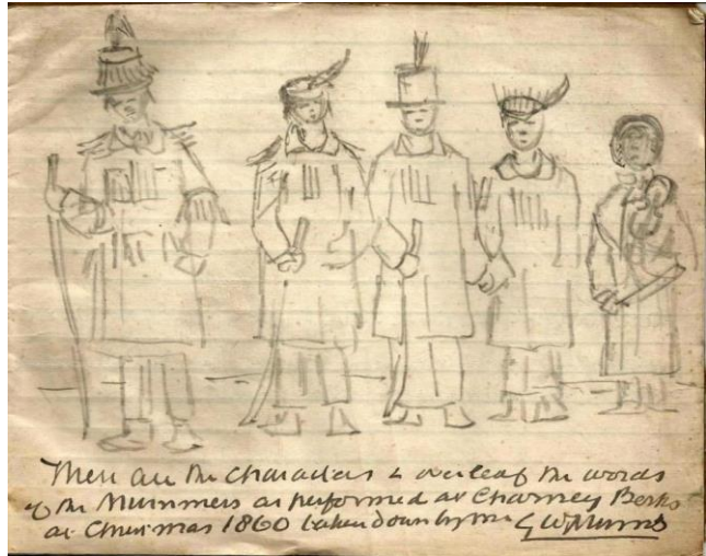
Contemporary sketch of the Mummers