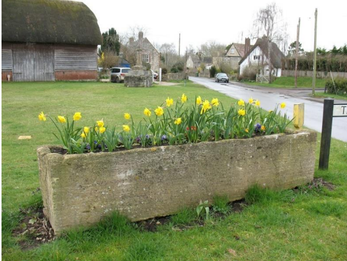
The trough on the Green